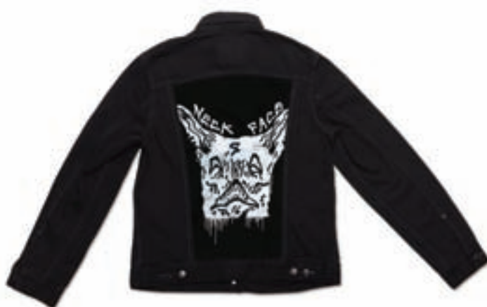
NECK FACE RELEASED ON 7/16