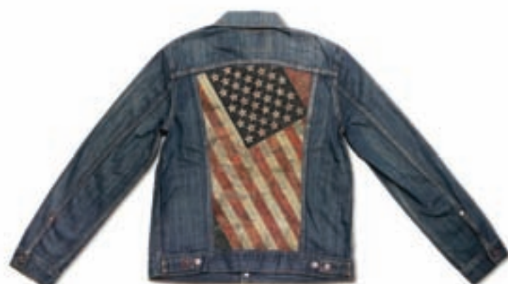
SHEPARD FAIREY RELEASED ON 7/2