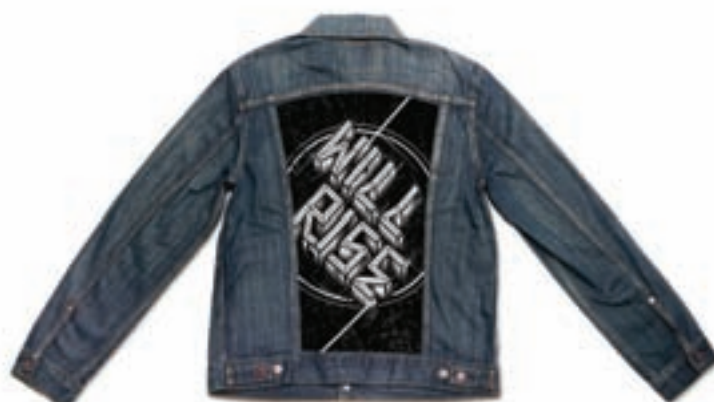
REVOK RELEASED ON 6/18