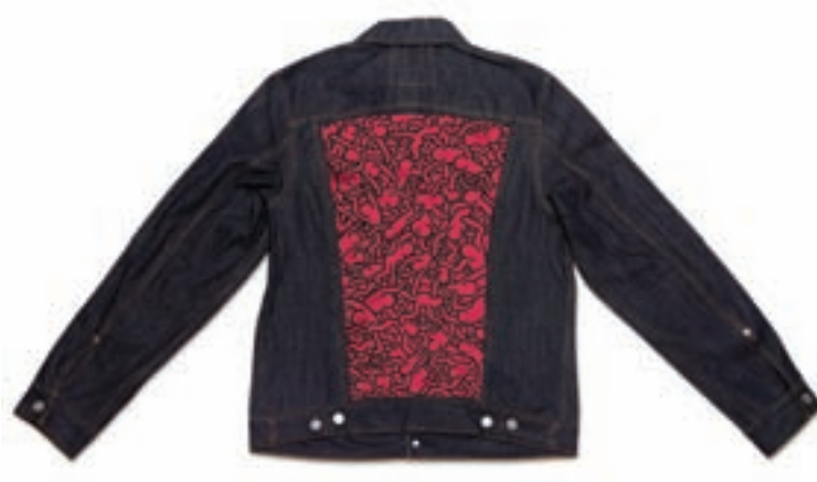
KEITH HARING RELEASED ON 8/6