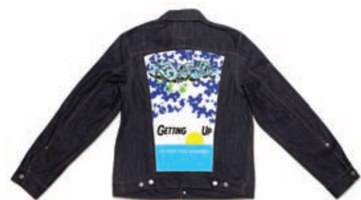
PURE TFP WITH STEPHEN POWERS RELEASED ON 6/18

All proceeds from the sale of this jacket benefit MOCA and its community programs.